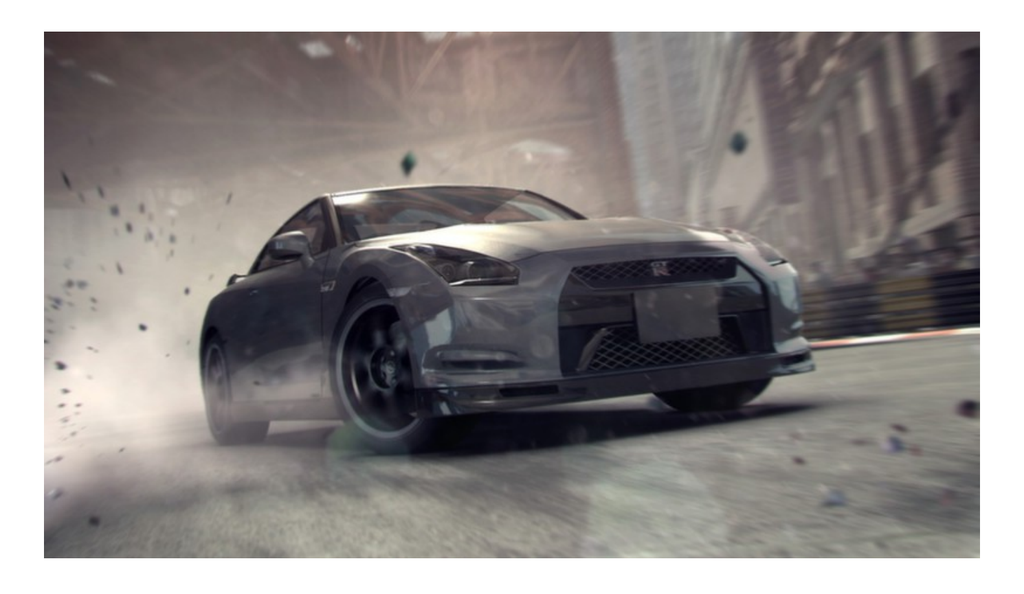
GRID 2 - GTR Racing Pack Download Crack Cocaine

Download >>> <a href="http://bit.ly/2Jlr36Y">http://bit.ly/2Jlr36Y</a>