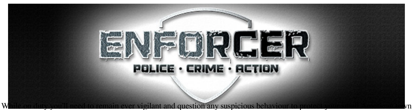
from a rising criminal threat. Off duty you'll need to visit friends, family and live life to its fullest. Your actions while at work and home affect your stress levels. If you spend too much time fighting crime, you will be under severe pressure that will affect your ability to uphold the law.